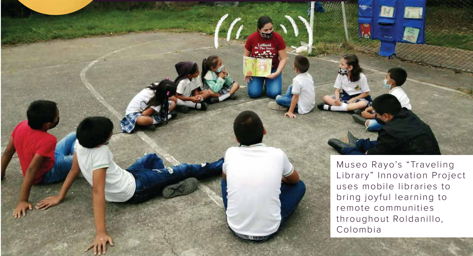
Museo Rayo's "Traveling Library" Innovation Project uses mobile libraries to bring joyful learning to remote communities throughout Roldanillo, Colombia

In 2021, LitWorld piloted two new partnership models: Network Partners and Innovation Partners . Our Network Partners help scale LitClubs and other LitWorld programming, while Innovation Partners help deepen our impact and explore new ways of creating change in communities through 'Innovation Projects'.