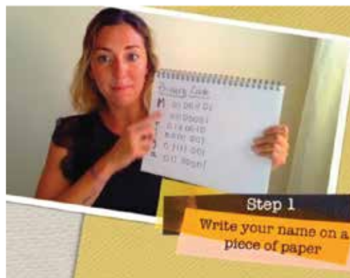
An episode of LitWorld's Virtual LitClubs