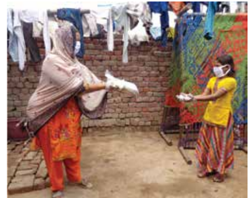
Mentors & LitKids distributing food at Seeds of Hope, Pakistan