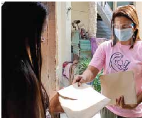
LitMoms delivering LitKits at Project PEARLS, Philippines